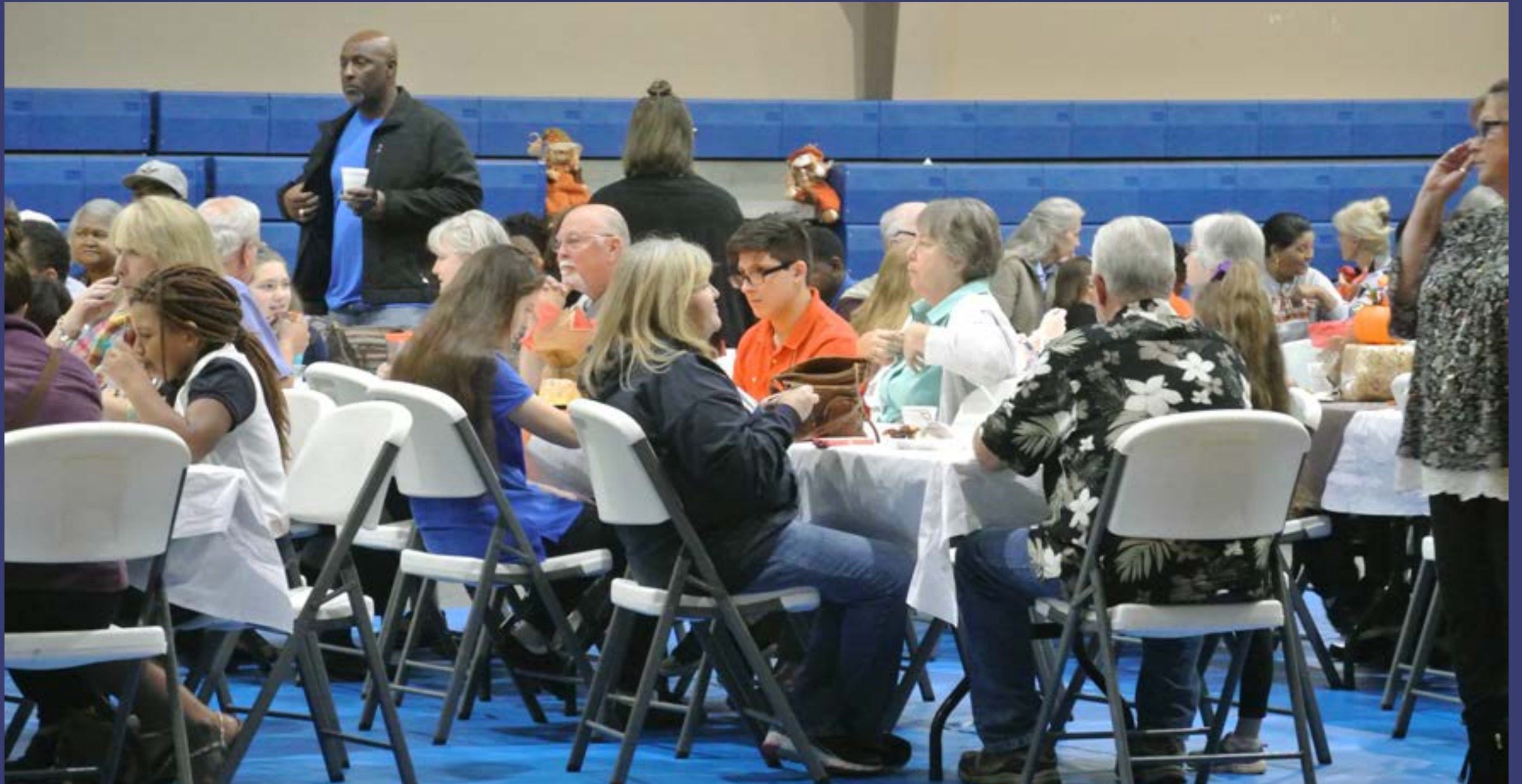
Grandparents Day Breakfast