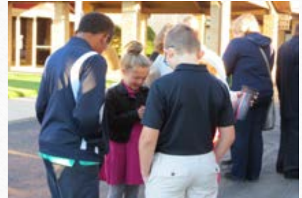
“See You at the Pole”