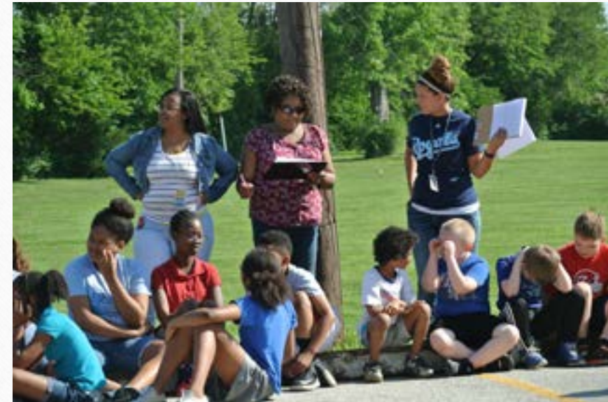
Elementary Field Day 2017