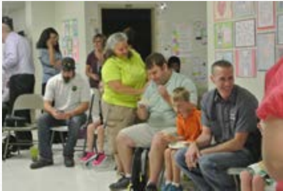
Dads and Donuts