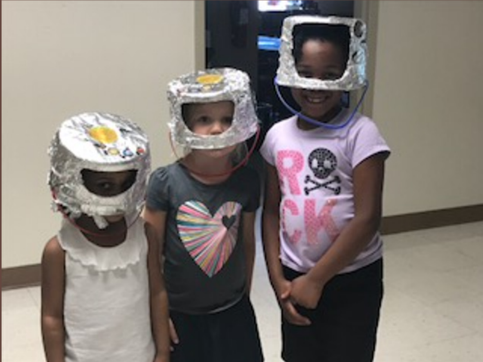
Summer Blast Camp – Astronauts Blast Off